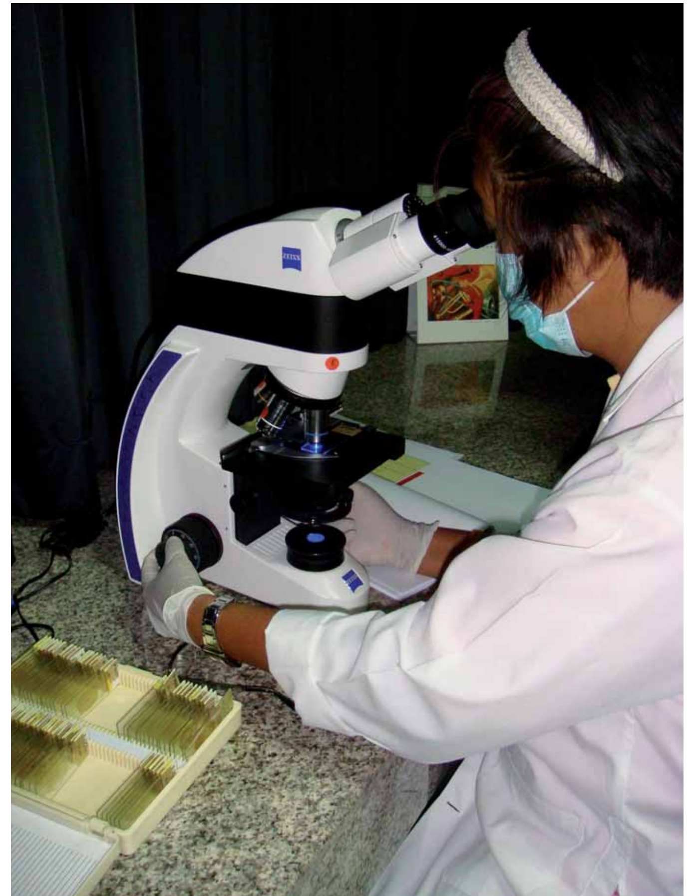
LED fluorescence microscopy – a multiple disease platform