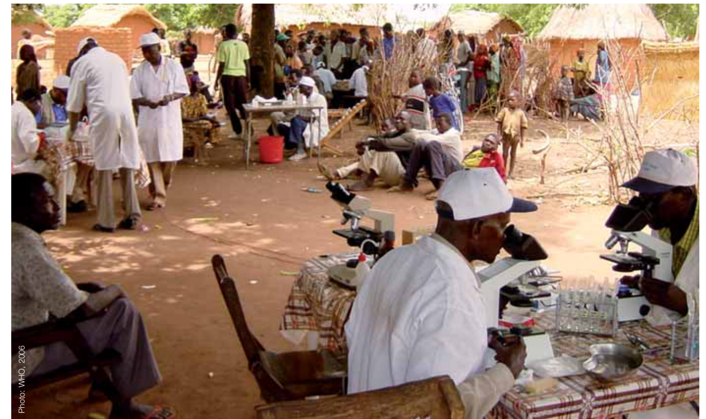
Screening a community in a sleeping sickness endemic area

“As head of an organization dedicated to making new medicines available for the world's most neglected, we recognize the invaluable contribution of FIND in developing critically needed diagnostics that are a key element in providing adequate treatment for the poorest. In particular, I am pleased to acknowledge that by choosing sleeping sickness as one of its priorities, FIND is showing a strong commitment towards controlling this debilitating disease in rural Africa.”