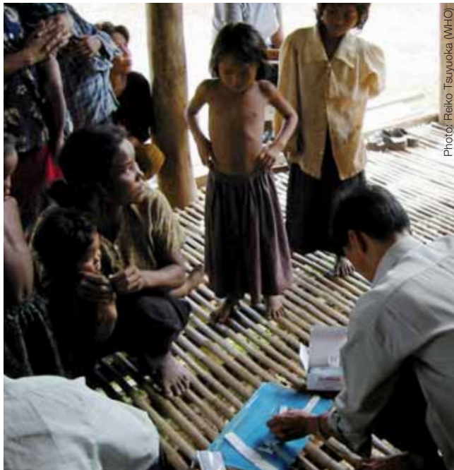
Bringing accurate malaria RDT to the household level in remote villages

Malaria was added to FIND's disease portfolio in 2007. This parasitic disease is one of the greatest global threats to public health, causing more than 300 million cases of acute illness worldwide and killing more than one million people each year, the vast majority of them children in sub-Saharan Africa. In some developing countries, malaria accounts for as much as 40 percent of the public health expenditure. Early and accurate diagnosis is critical to malaria control. What's more, inaccurate diagnosis fuels drug resistance, wastes scarce resources and often results in death from mistreatment.