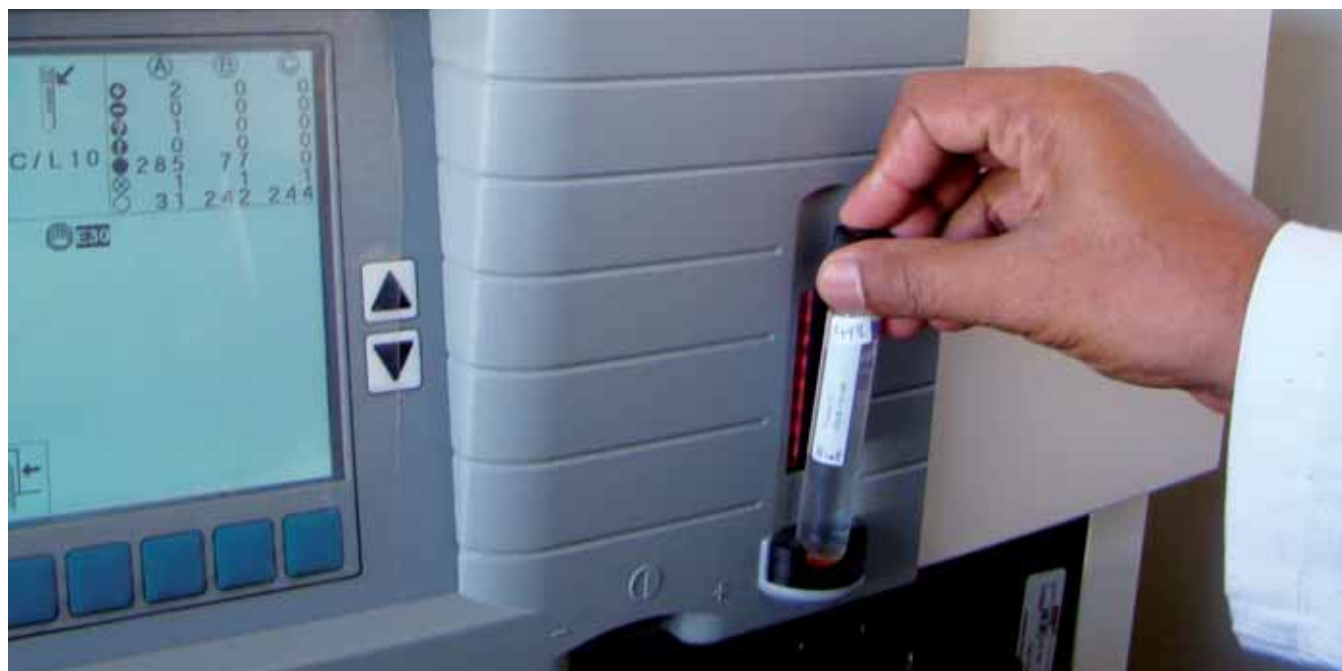
Liquid culture halves the time for performing TB culture and drug susceptibility testing compared to classic solid culture