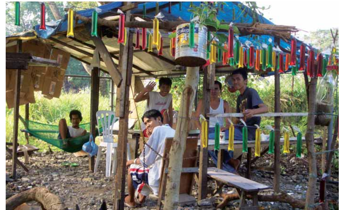
A TB hospital in the Philippines