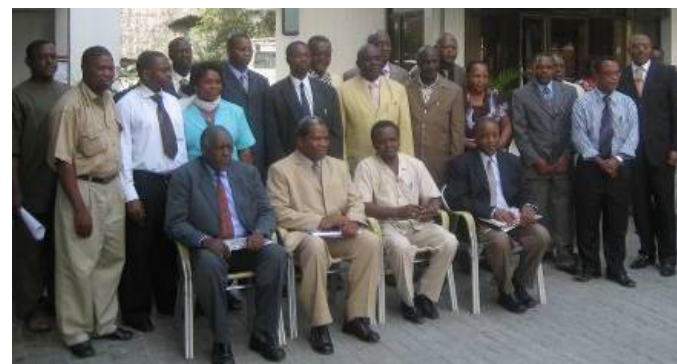
Contact persons for Advocacy on AT during an induction workshop in September 2008

Angola Democratic Republic of Congo Republic of Congo Gabon Malawi Tanzania Kenya Uganda Sudan Central African Republic Nigeria Côte d'Ivoire Guinea